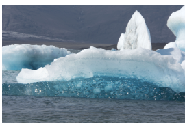
Iceberg 5, Ice lagoon Jökulsárlón Direct printing under acrylic glass 2mm glossy with metal rail suspension rounded corners / 90 x 60 cm