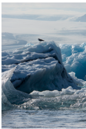
Iceberg, Ice lagoon Jökulsárlón Direct printing under acrylic glass 2mm glossy with metal rail suspension 40 x 60 cm