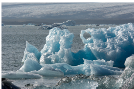
Iceberg 3, Ice lagoon Jökulsárlón Direct printing under acrylic glass 2mm glossy with metal rail suspension rounded corners / 90 x 60 cm