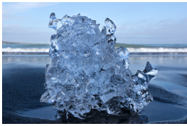
Glace, Ice lagoon Jökulsárlón Direct printing under acrylic glass 2mm glossy with metal rail suspension rounded corners / 90 x 60 cm