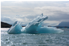
Iceberg 2, Ice lagoon Jökulsárlón Direct printing under acrylic glass 2mm glossy with metal rail suspension rounded corners / 90 x 60 cm