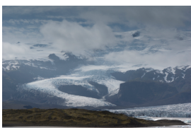
Svínafellsjökull, glacier tongue Vatnajökull Direct printing under acrylic glass 2mm glossy with metal rail suspension rounded corners / 90 x 60 cm