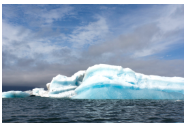
Iceberg 4, Ice lagoon Jökulsárlón Direct printing under acrylic glass 2mm glossy with metal rail suspension rounded corners / 90 x 60 cm